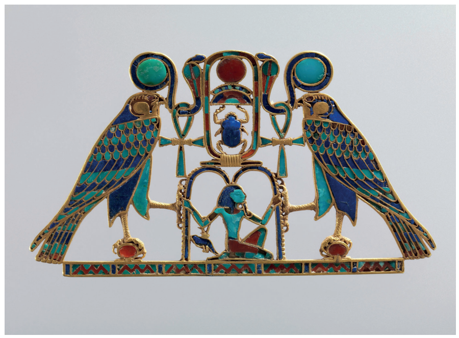
Detail of pendant

Ancient Egyptian Necklace (approximately 4000 years old) Materials: gold and inlaid semi-precious stones (length: 82 cm, dimensions of pendant: 4.5 x 8 cm)