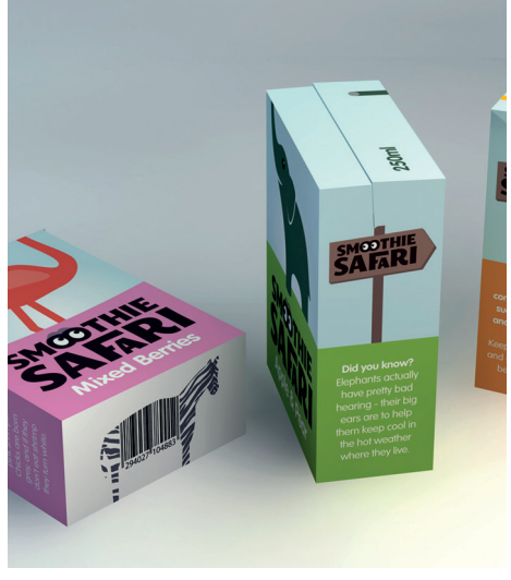
'Smoothie Safari' drink carton with straw (2012) by Luke Thomson