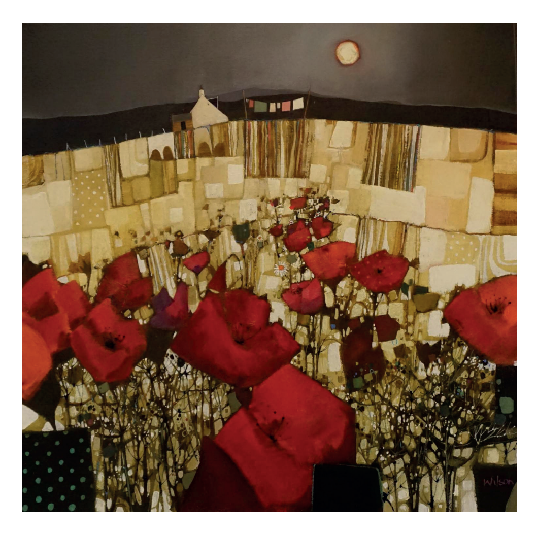
The Moon, Skye (2019) by Gordon Wilson Oil paint on canvas (76 x 76 cm)