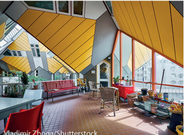
Cube Houses, Rotterdam (1977) by Piet Blom Materials: concrete, wood, and glass