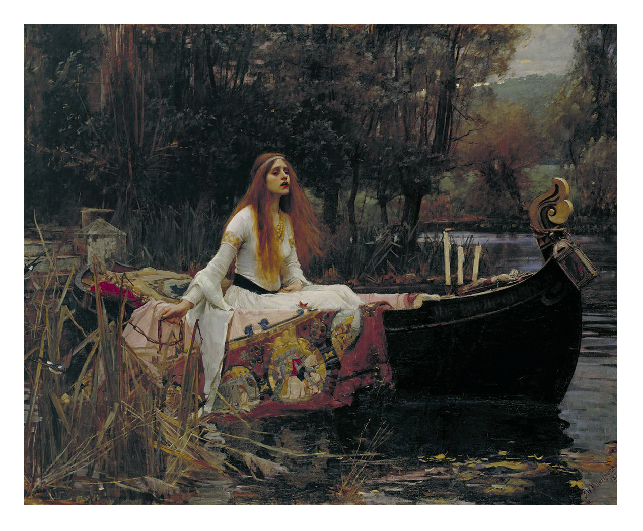
The Lady of Shalott (1888) by John William Waterhouse Oil paint on canvas (153 x 200 cm)