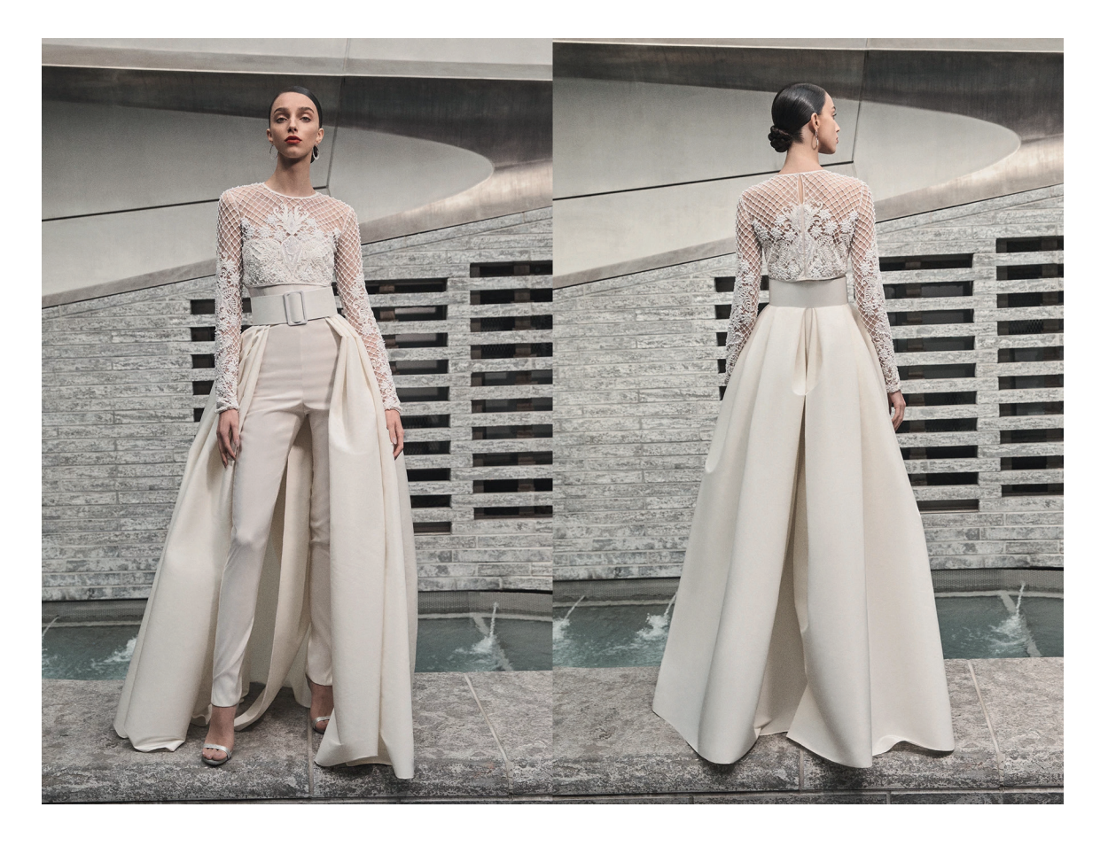
Bridal jumpsuit with detachable belted skirt (2019) by Naeem Khan Materials: silk, lace, embroidered details and crystal beads