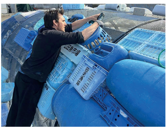
Sculpture during construction